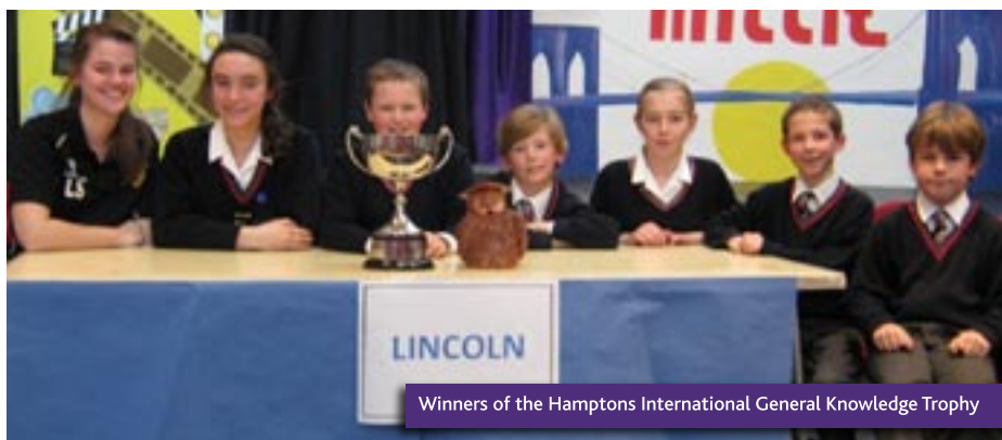
Winners of the Hamptons International General Knowledge Trophy

Well done to everyone who took part in this event!