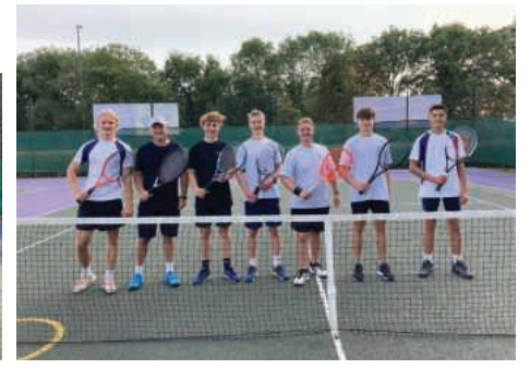
OW Tennis Pupils & OWs

Please let us know of any announcements for The Wycliffian Society Times 2022 issue and Wycliffe Times. Please contact TWS@wycliffe.co.uk