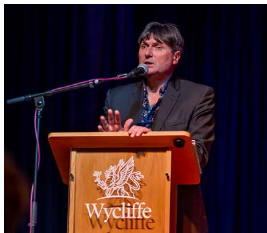
Simon Armitage, Poet Laureate visited Wycliffe for an evening of poetry.